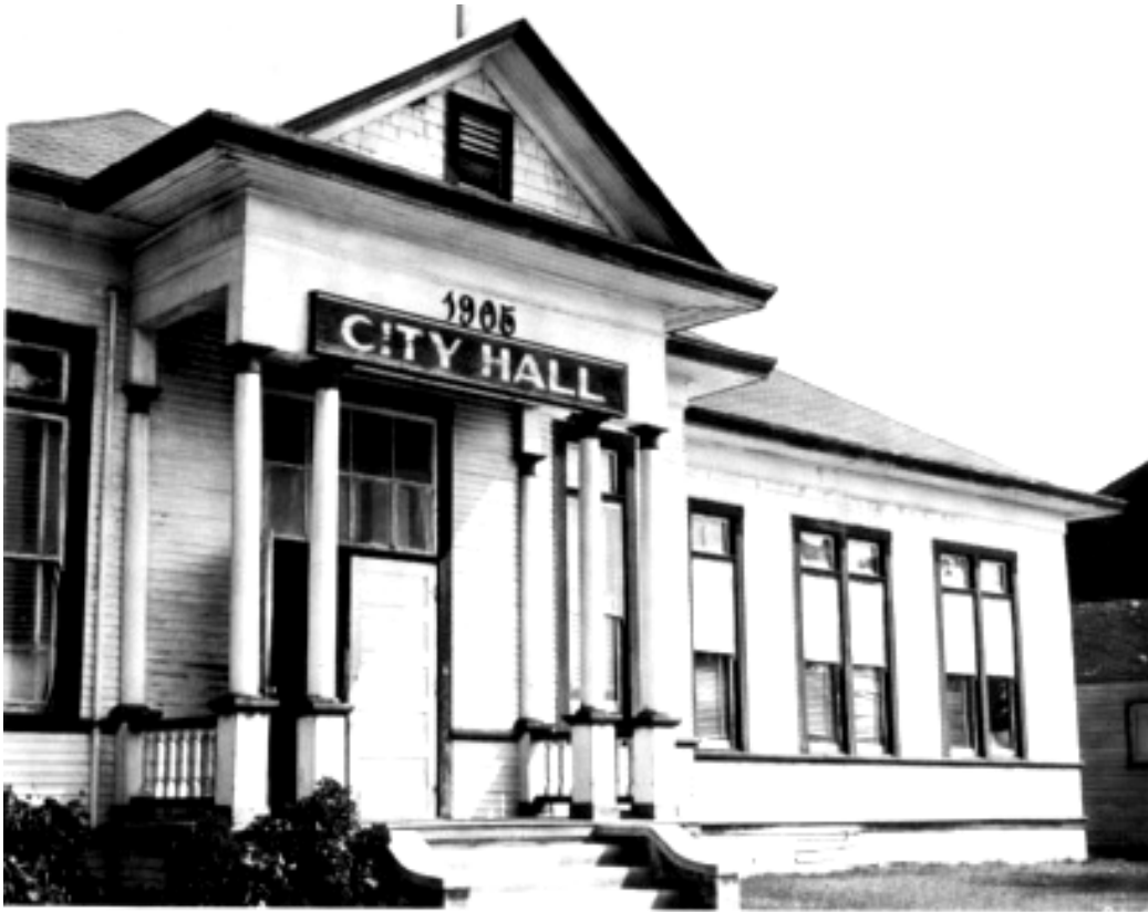
Newport Beach's first City Hall. Originally this structure was an elementary school.