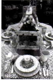
Shell relief table top Settings, Pebble Placemats, Candles & Flatware