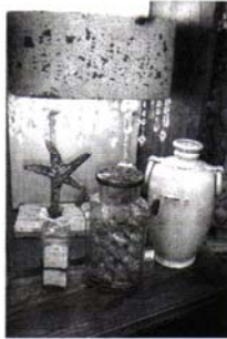
Fragrance of Spring... Romance, Candles, Oils, Aromatique, Boutique...