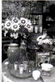
Accessories to light, & Accents for your home.